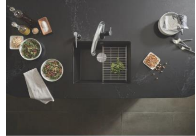
BLANCO Coal Black SILGRANIT sink color, new for 2021